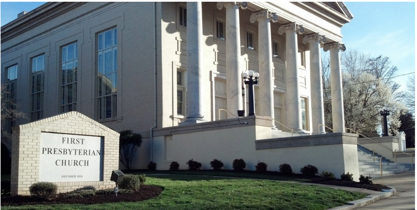
First Presbyterian Church 937 Main Street Danville, VA 24541-1809