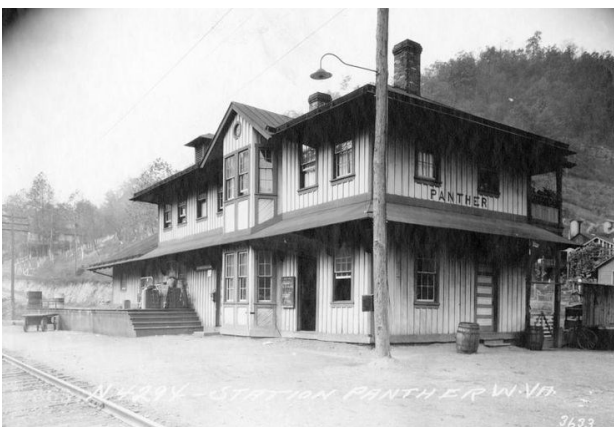
Panther Train Station circa 1948