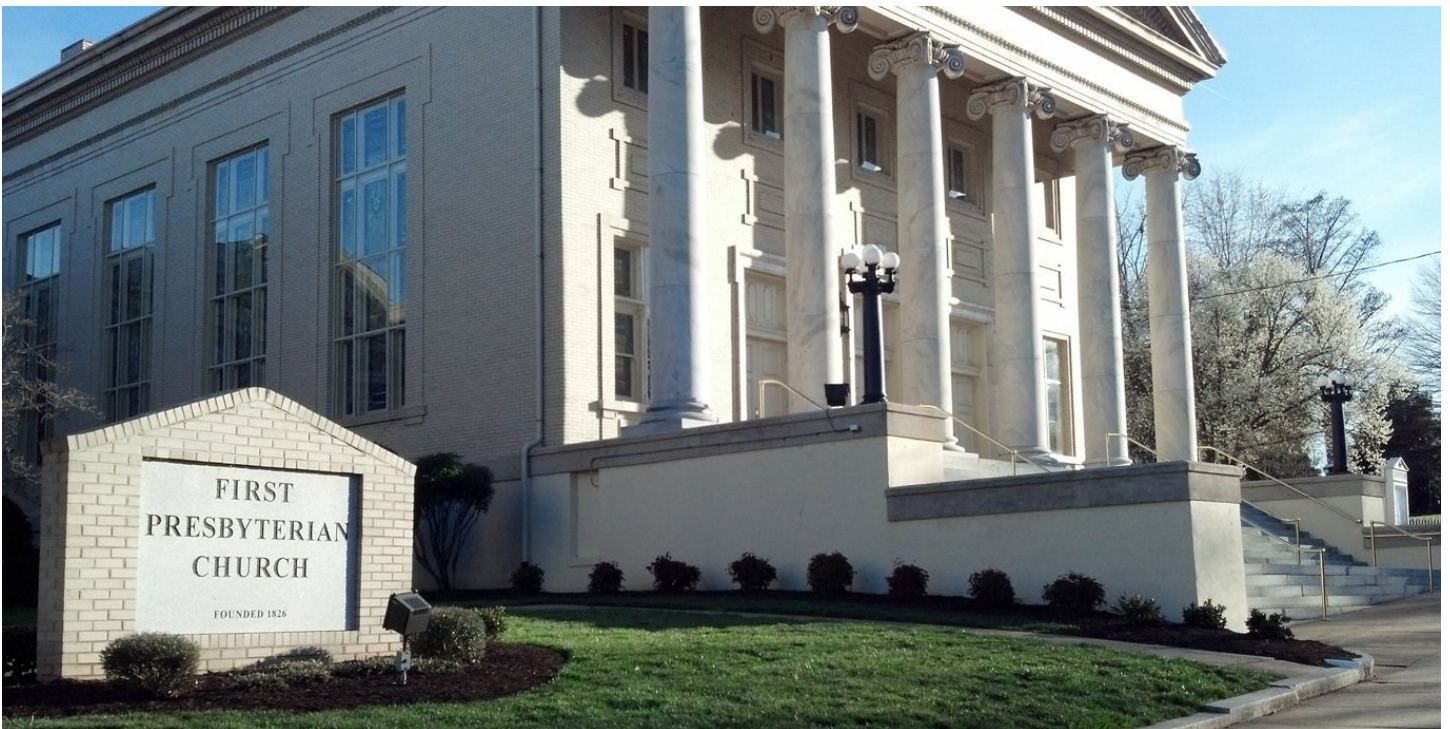
First Presbyterian Church 937 Main Street Danville, VA 24541-1809