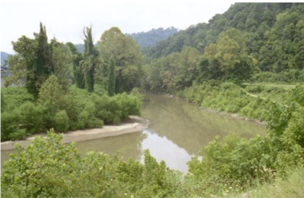
Panther, West Virginia is located along the Tug Fork which is a tributary of the Big Sandy River